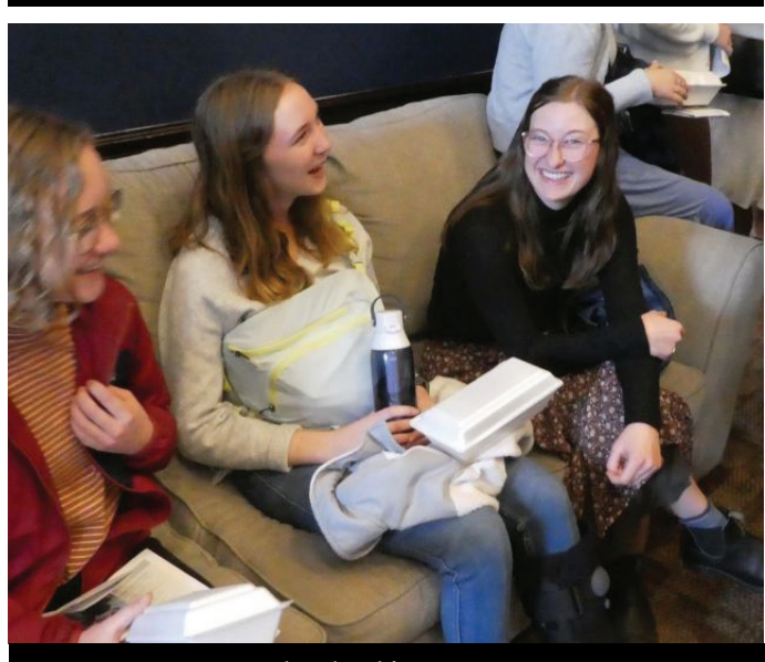
St. Elizabeth's Feast Day