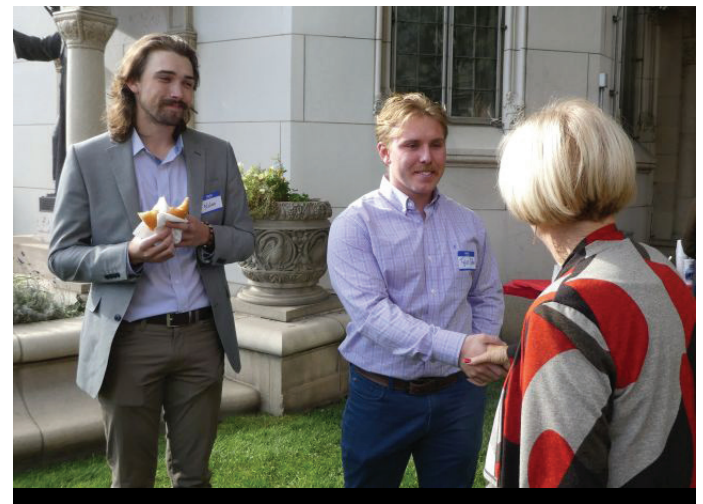
Meet and Greet