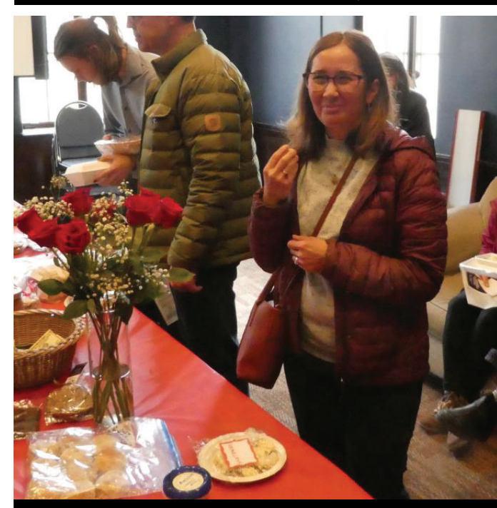
Cookies Finding People's Hearts