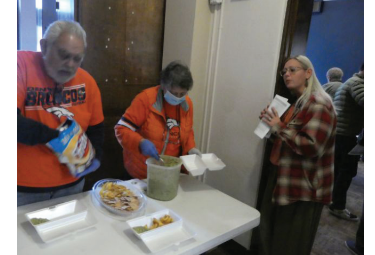
Dee's Famous Guacamole!