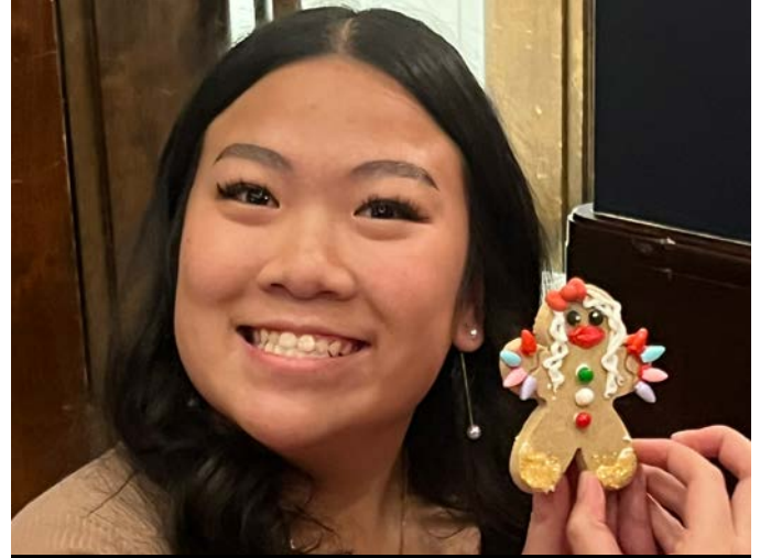
Christmas Cookie Party