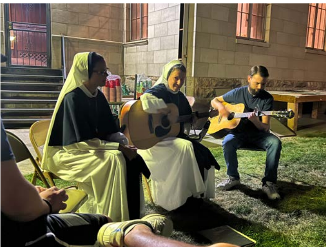
Visit of the Sisters of Life